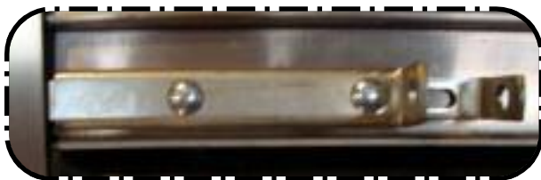
Slide Locks Optional

We also have the ability to accurately match the customer's color requirements when provided with the appropriate material samples.