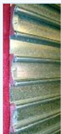
1 1/4" BABY FLAT SLAT

*Opening preparation, miscellaneous or structural metal work, access doors, finish or field painting, field electrical wiring, wire, conduit, fuses and disconnect switches are in the Scope of Work of other divisions or trades.