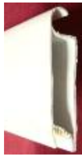
Extruded plastic backing

We also have the ability to accurately match the customer's color requirements when provided with the appropriate material samples.