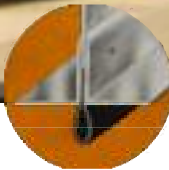
3" Curve with continuous windlock endlocks (optional)