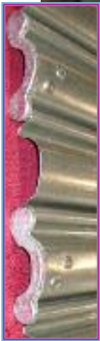
3" Curve with endlocks