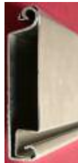
IMB - V7 7" INTERLOCK INSULATED SLAT