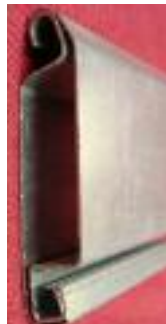
IMB - V5 5" INTERLOCK INSULATED SLAT

See WIND-TITE / SERV-DAWN in this catalog for larger doors and custom design windload specifications. Programs are designed and reviewed by Professional Engineers.