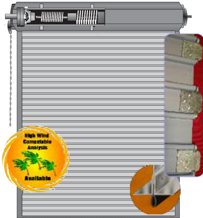
Standard Slide Locks