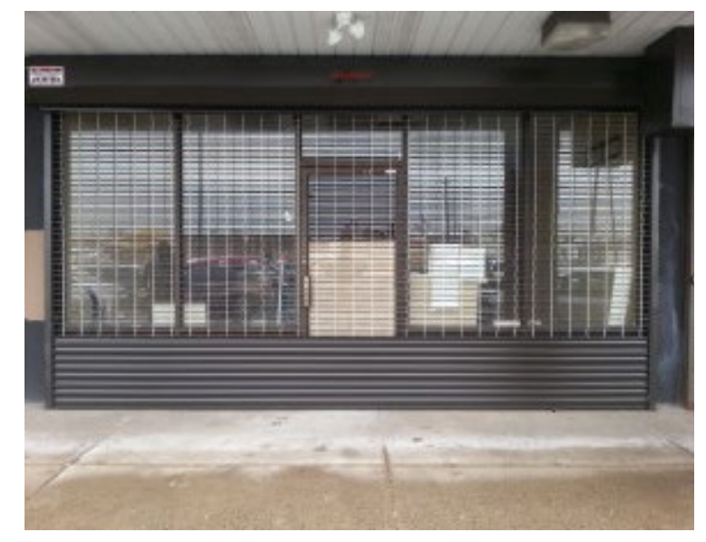
Shown with optional grille/slat combination

E-Series Grille™ is designed for easy operation and long life use with minimum maintenance required. Ideal for stores, malls and shopping centers. This roll down security door is also used to protect glass window and service window openings.