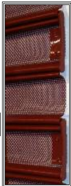
Front of Coil Side