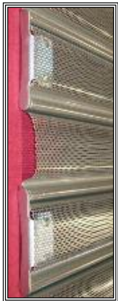
Back of Coil Side

Rolling Steel-Vision Flat Slat doors are manufactured by Alpine Overhead Doors, Inc. Opening preparation, miscellaneous or structural metal work, access doors, finish or field painting, field electrical wiring, wire, conduit, fuses and disconnect switches are in the Scope of Work of other divisions or trades.